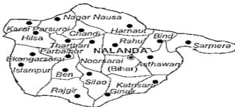
Figure 1: Nalanda district map

ideal climate and rich soil, Nalanda, which is centrally located in the state, has a long history of agriculture. Nevertheless, the district faces systemic problems that prevent it from reaching its full agricultural potential, including fragmented landholdings, water scarcity, and inadequate infrastructure. Nalanda is a symbol of creativity and resiliency in spite of these obstacles, as local farmers use technology to increase output and reduce risks while embracing sustainable farming methods. In addition, cooperative initiatives between governmental bodies, non-governmental organisations, and community-based groups have produced encouraging outcomes in areas including market access, agricultural diversification, and watershed management. For policy-makers and practitioners looking to support agricultural development and enhance farmer livelihoods in Bihar and beyond, Nalanda offers a fascinating case study by using the district's inherent strengths and tackling its underlying weaknesses.